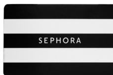
$25 Sephora Gift Card