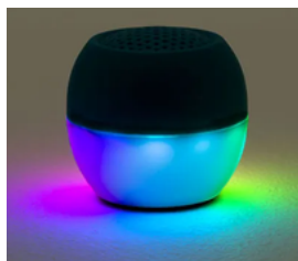
Mini Bluetooth Speaker