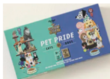
Dueling Jigsaw Puzzle Game