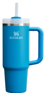
Stanley Water Cup

Use your tickets to compete for raffle prizes like these!