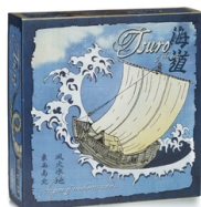
Tsuru of the Seas Game