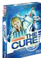
Pandemic: The Cure Game