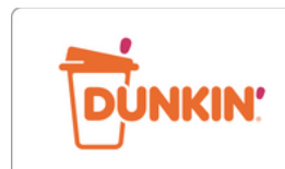
$25 Dunkin' Gift Card