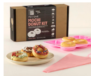
Mochi Donut Making Kit