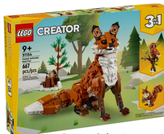
Lego 3 in 1 Woodland Creatures Set